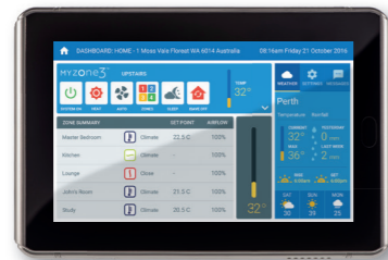
Myzone 3 Controller