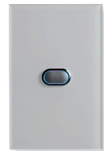
Wireless Zone Sensor

Myzone offers an easy to use App which enables you to control your air conditioning system via your smart phone or tablet. This App gives you even greater control with 4G access from anywhere providing savings and a more efficient solution. Now the whole family can come home to the perfect temperature.