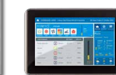
Myzone 3 Controller